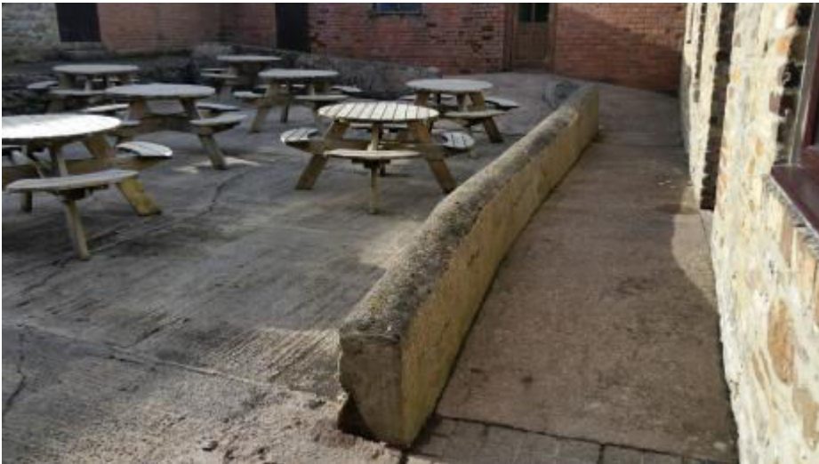
Tea Room Courtyard 2