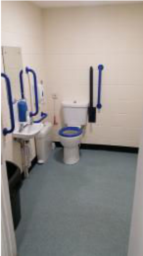
Disabled Toilet - Inside