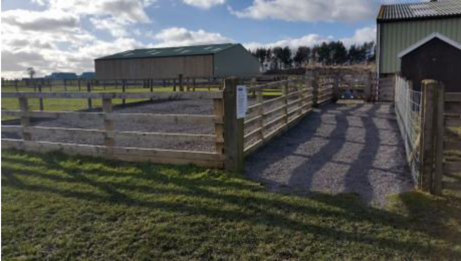
Entrance to water wars