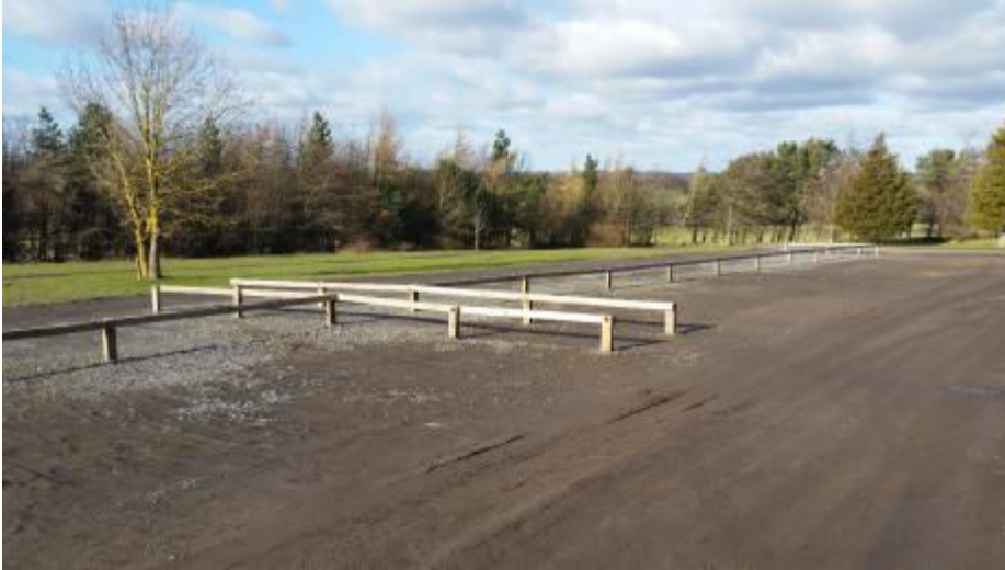
Car Parking 2