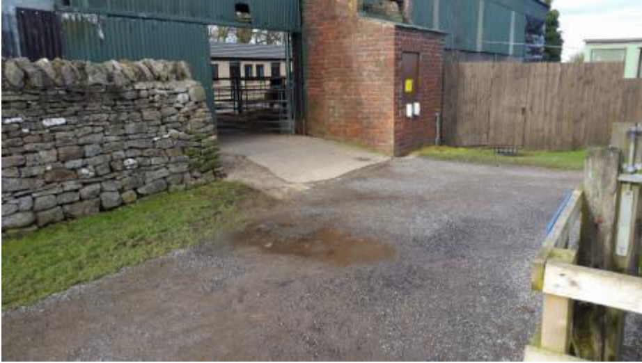
Gravel Path to the Donkeys