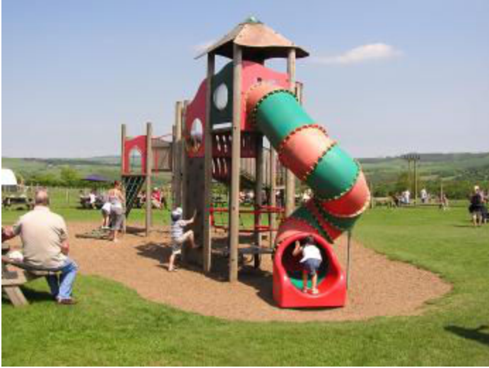
Playarea & Picnic Area