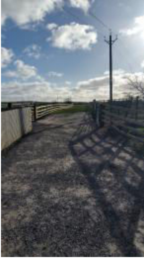
Gravel Path to the Animal Paddocks