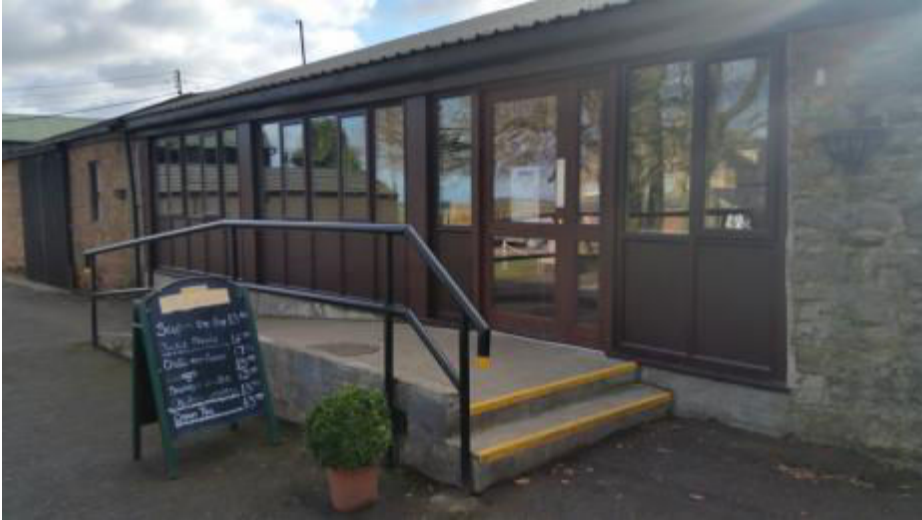
Tea Room Steps