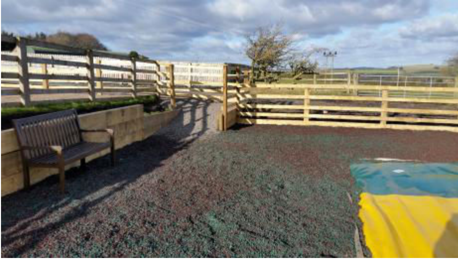
Pillow 2 Entrance