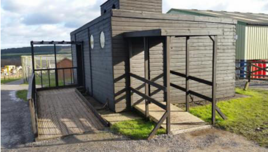
Entrance & Exit to the Ark