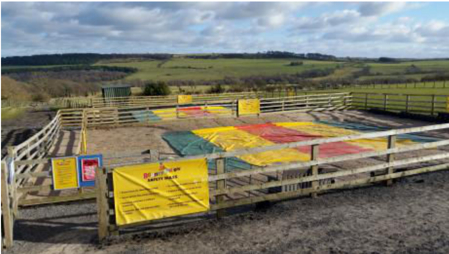
Bouncy Pillows Overview