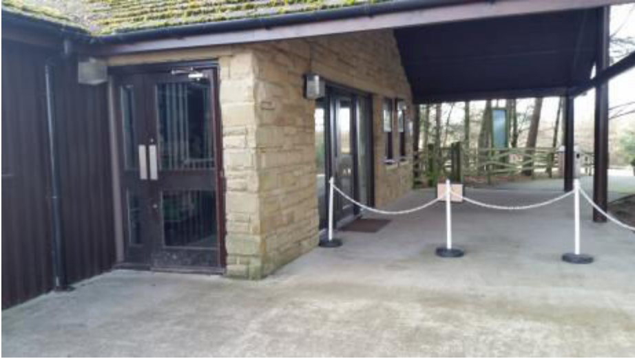
Entrance / Exit Door