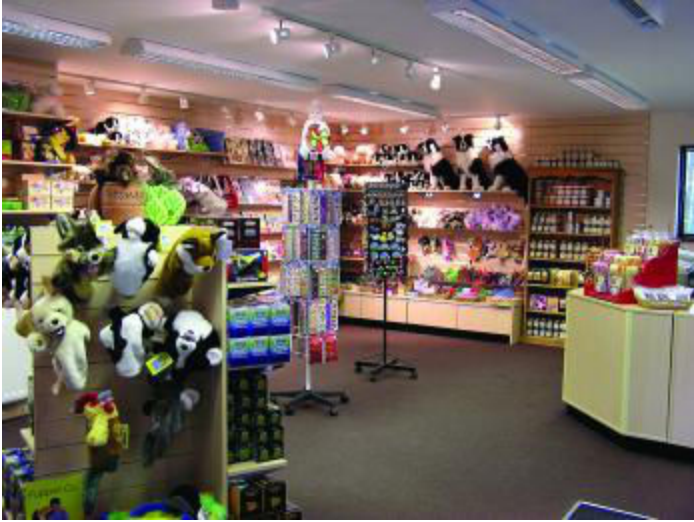
Gift Shop - Internal