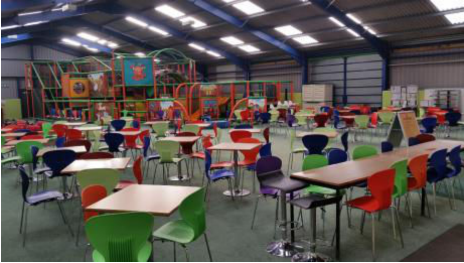
Internal View 1