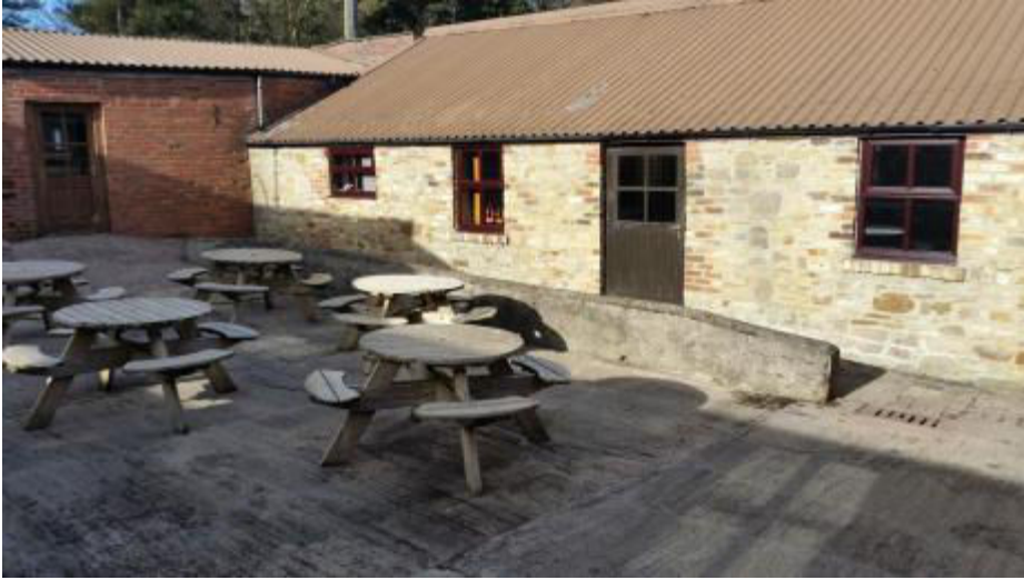
Tea Room Courtyard 1