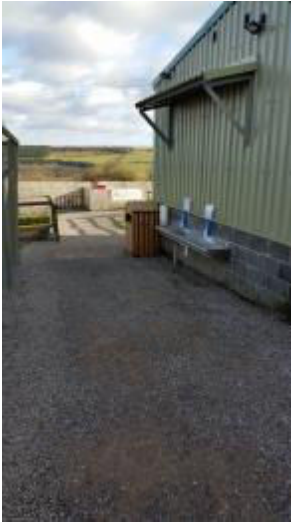
Gravel Path to The Paddocks/Crazy Golf & Bouncy Pillows