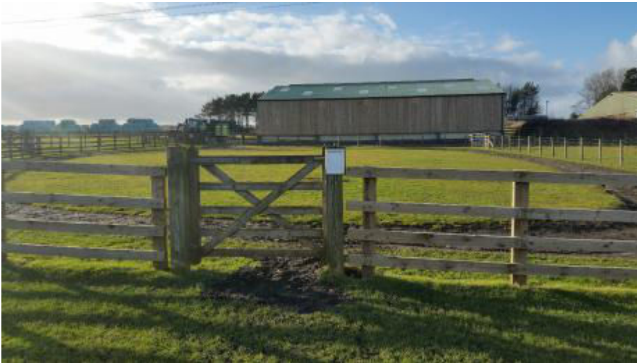
Barrel Train Entrance/Exit