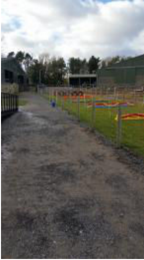
Gravel Path to the Sheep Race/Tractor Ride & The Ark