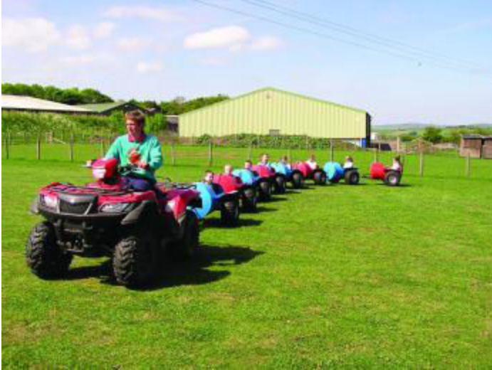
Barrel Train Ride