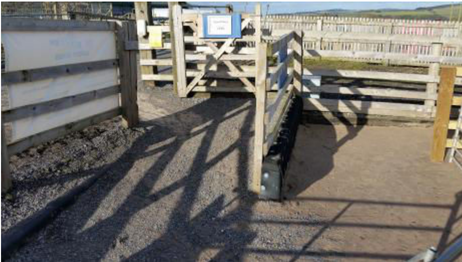
Pillow 1 & 2 Entrance