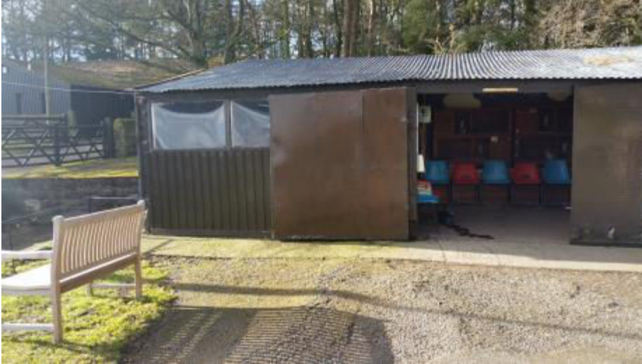
Entrance to Rabbits