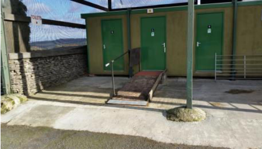
Disable Toilet with Ramp