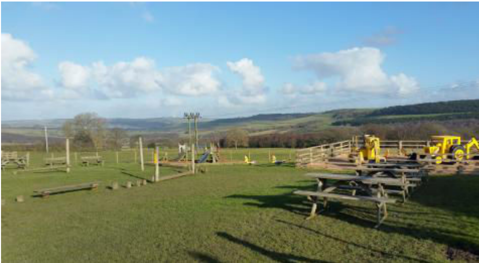
Outdoor Picnic Area