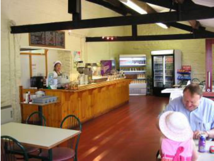
Tea Room - Internal