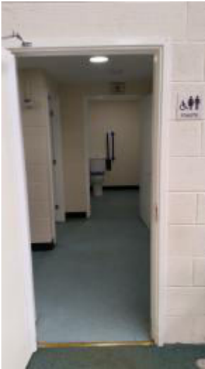
Internal Entrance from Playbarn