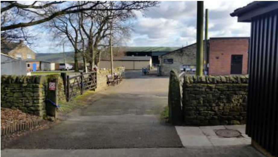
Entrance into Farmyard