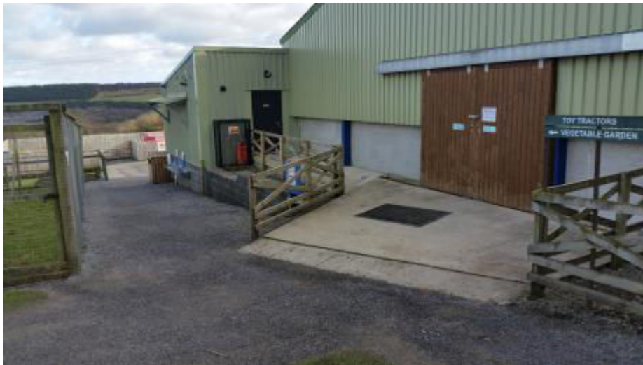
Entrance to Playbarn

Full table service is not available Food or drinks are ordered from the service counter (H)900mm) Food or drinks can be brought to the table No tables are permanently fixed No chairs are permanently fixed The standard height for tables is 750mm Menus are wall only Menus are clearly written The type of food served here is snacks. There are sinks to the left as you enter the Soft Play Barn The height of the sinks are 690mm 10 x Highchairs 39 x Tables 156 x Chairs (Min) Door to the toilet area is (W)800mm