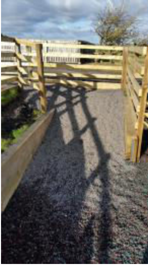
Pillow 2 Ramp