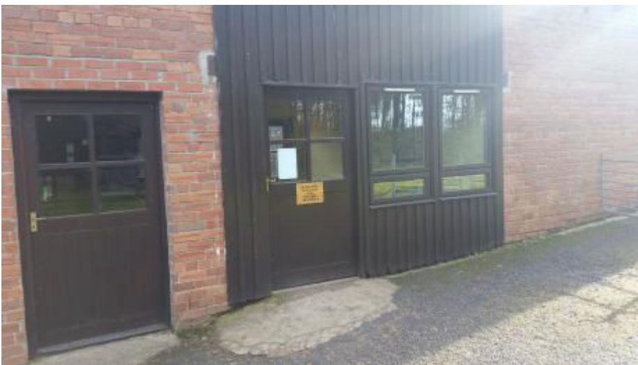
Entrance to Chicks