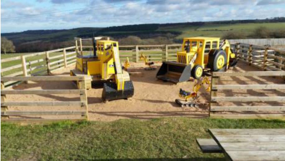
Entrance to Sandpit