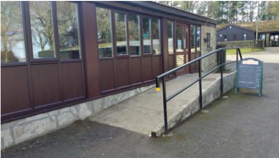
Tea Room Ramp