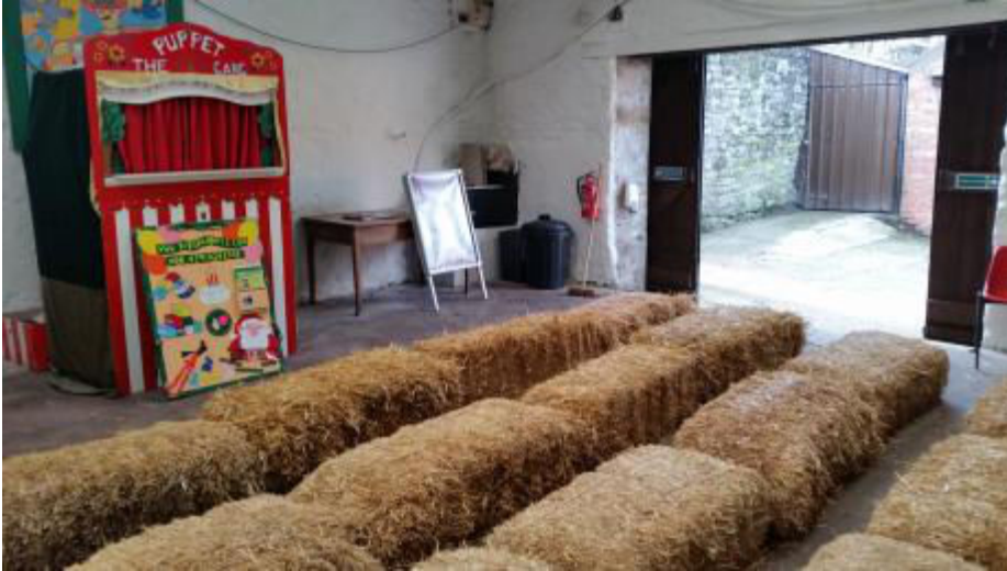
Inside the Puppet Show Barn