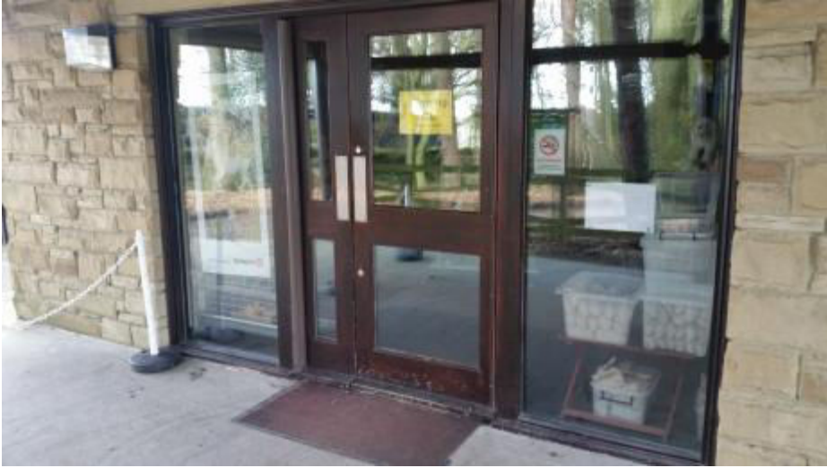
Front Entrance / Exit Door