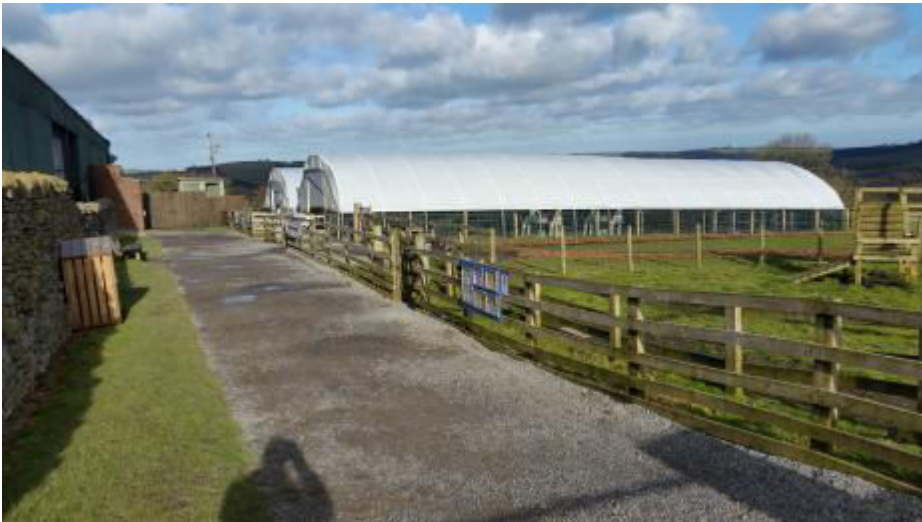
Gravel Path to the Playarea