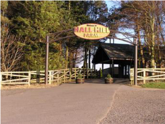
Entrance from Carpark

The car park does not have a height restriction barrier