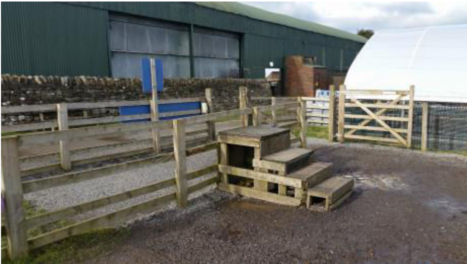
Donkey Ride Mounting Block