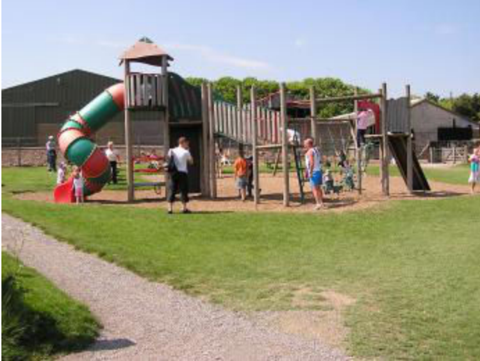
Outdoor Play Equipment