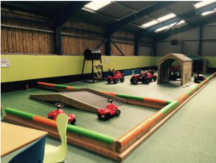
Toy Tractor Track