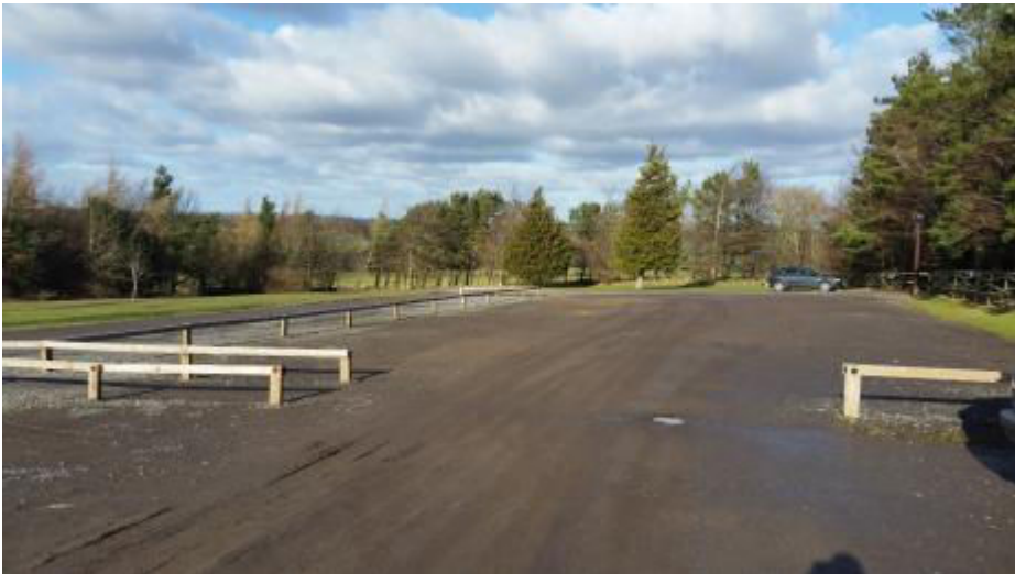
Car Parking 1