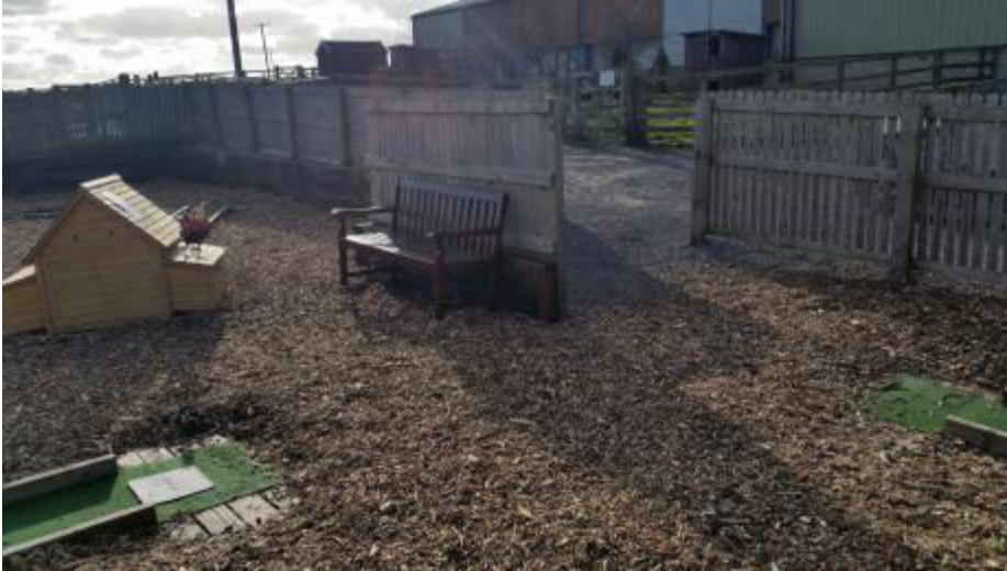
Crazy Golf Flooring detail