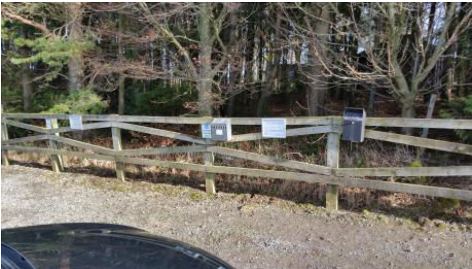
Smoking Area - Car Park